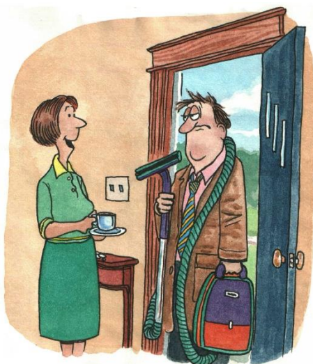
"Can you come back again next week and demonstrate its performance over the entire house?"