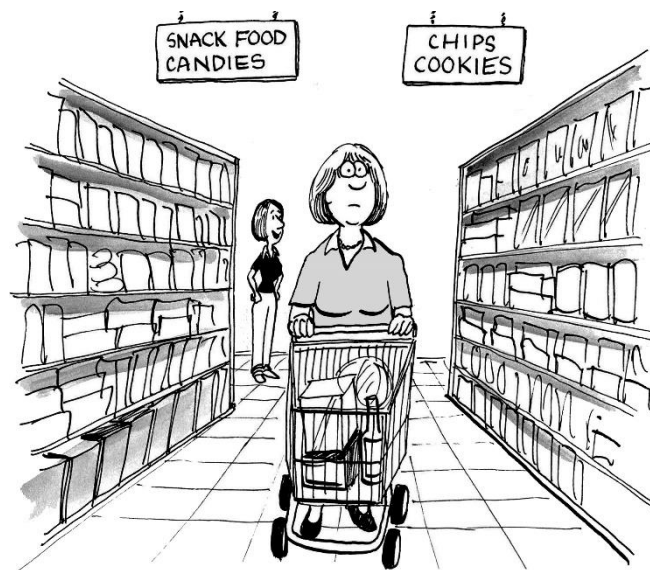
"Keep your eyes straight ahead and you can make it!"