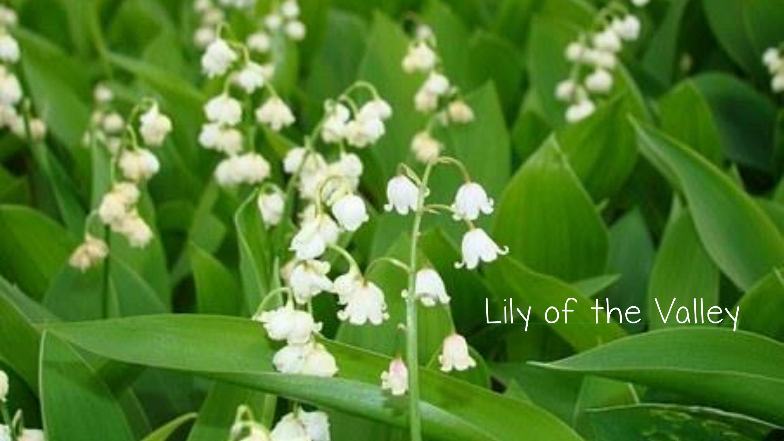
Lily of the Valley